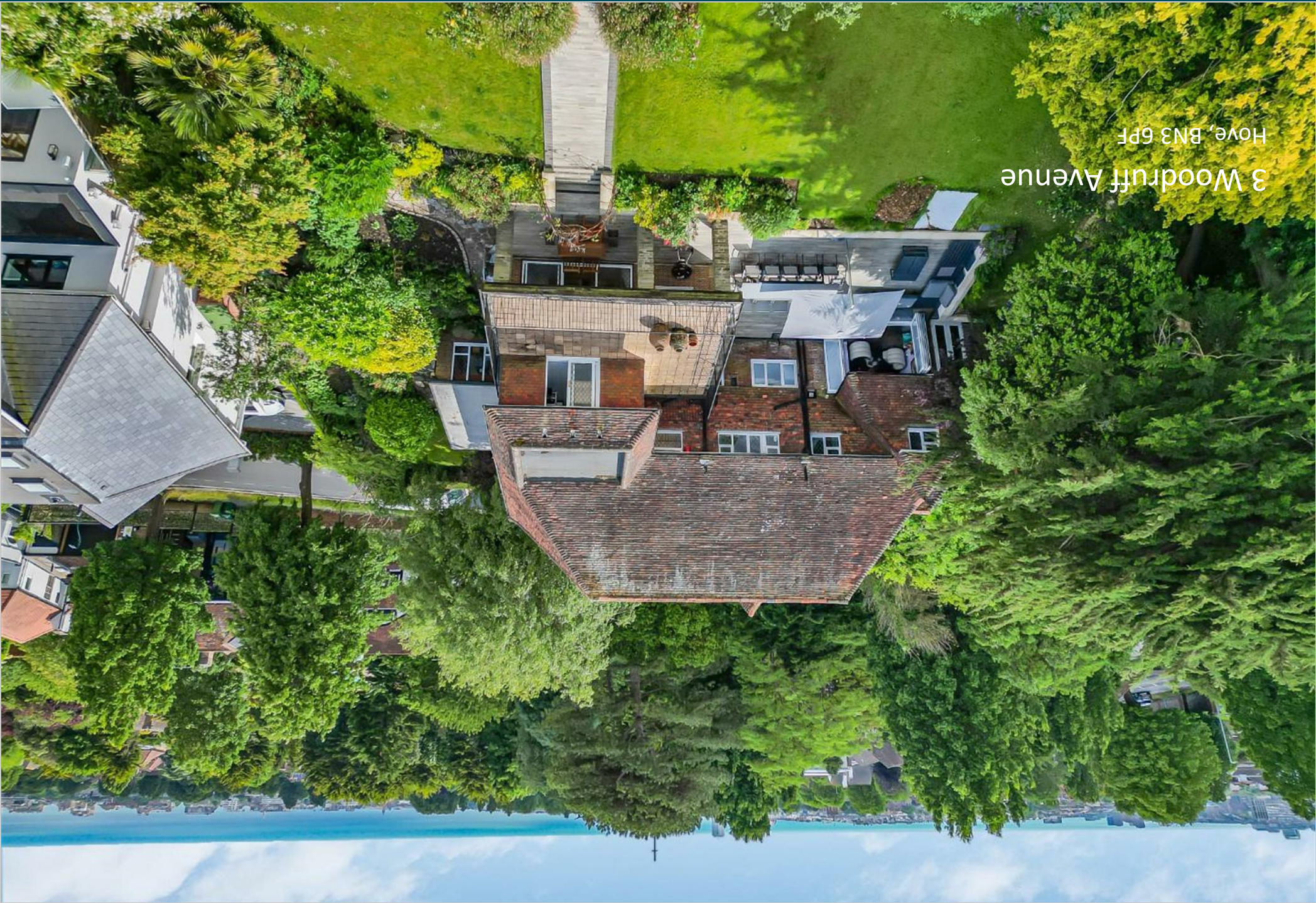
3 Woodruff Avenue Hove, BN3 6PF